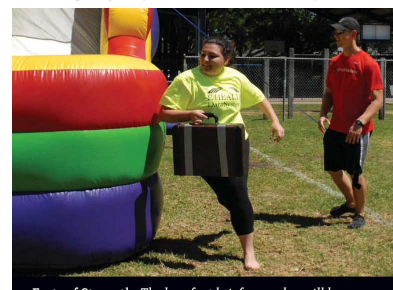
Feets of Strength: The barefoot briefcase relay will be a returning event to the 21st Annual Westchase District Corporate Challenge on April 6 at Quillian Center.

Thanks to all our major sponsors, who include: Amegy Bank; Camden; D.E. Harvey Builders; The Goodman Corporation;