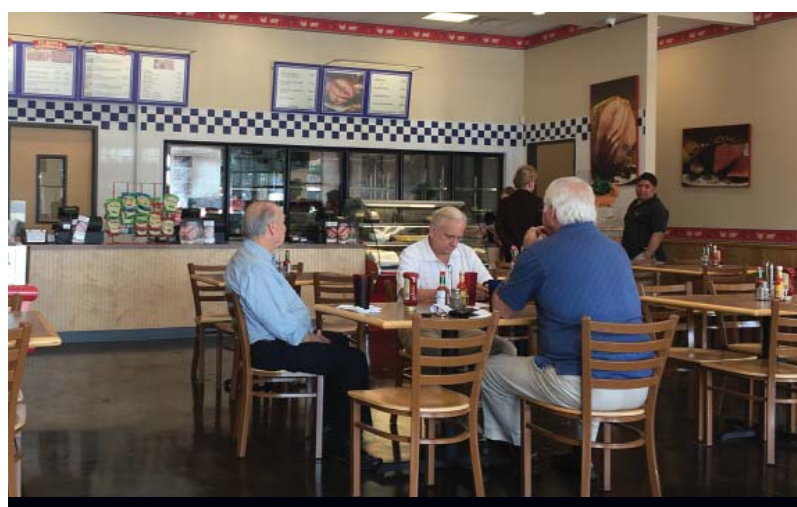
Elbow Room: At 5,800 square feet, Logan Farms' new location has a spacious storefront restaurant as well as two kitchens.

Whether preparing large corporate gift orders of a variety of meats to glazing just the right ham for a single family, Logan Farms has plenty of room to work. At 5,800 square feet,