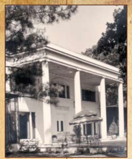
The Mooers Mansion still stands as part of the Lakeside Country Club