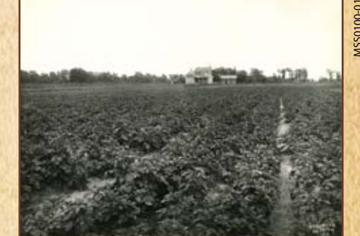
This land has provided a living for generations

As late as 1934, the only major roads designated on Harris County maps of the area were Westheimer, Rogers, Cooper, Dairy Ashford and Alief Houston Road (which is present day Richmond Road).