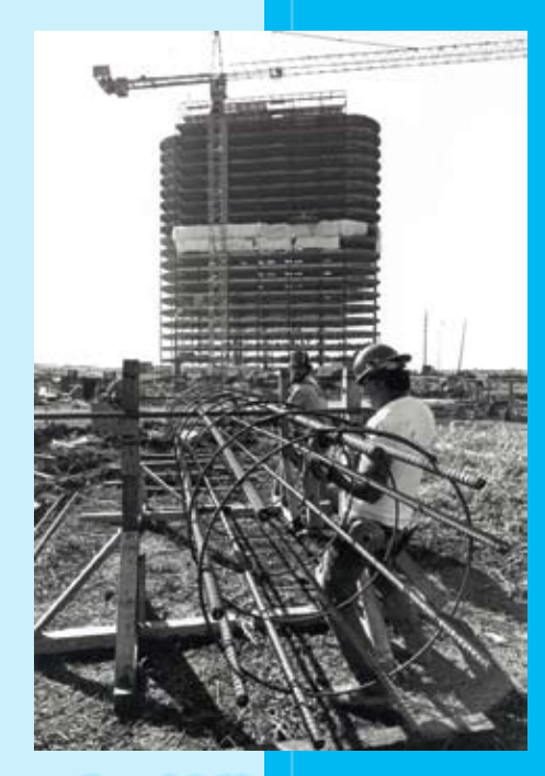
Ensearch Building under construction

In 1985, construction began on the West Belt Toll Road (renamed Sam Houston Tollway in 1988.) But the bottom soon dropped out of the real estate market and, as properties fell into foreclosure, the Westchase Business Council was formed. This membership-driven organization was created to help maintain property values and quality in the area at a time when the economy was faltering.